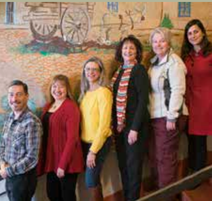
McCune Charitable Foundation Santa Fe, New Mexico