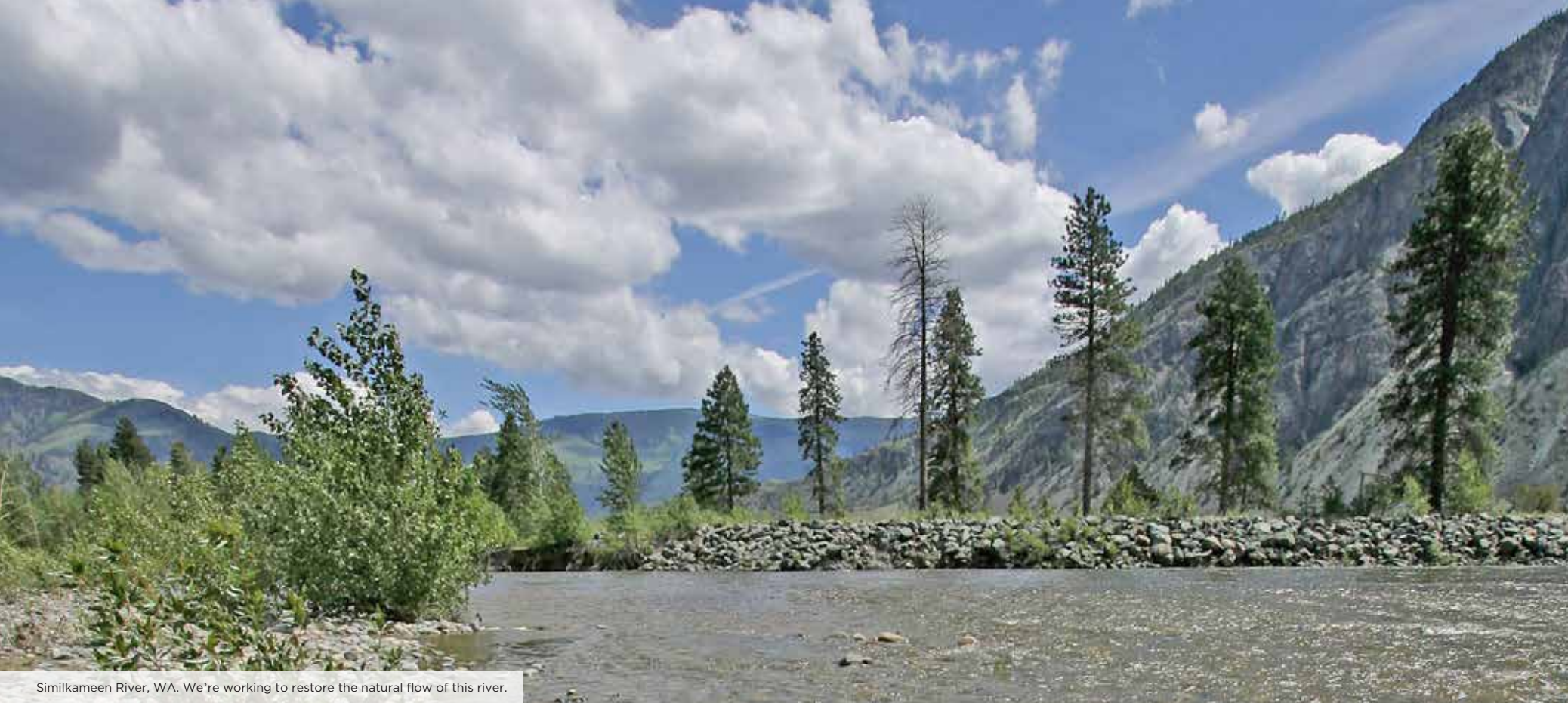
Similkameen River, WA. We're working to restore the natural flow of this river.